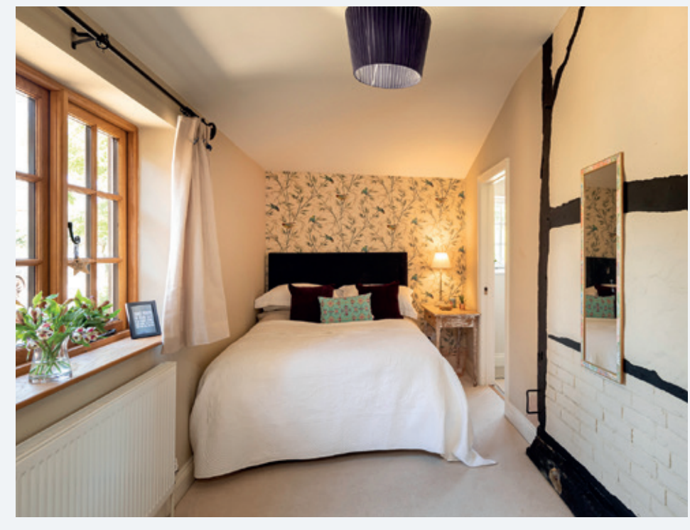
The bedrooms have many period features